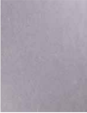
SILK VELVET TEXTURE French Grey