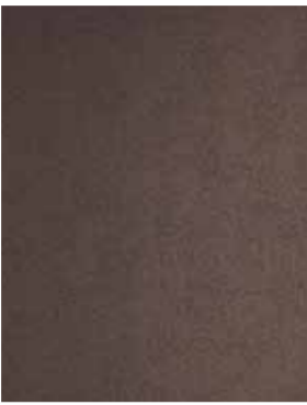
ORIENTAL CRACKLE TEXTURE Black Bronze