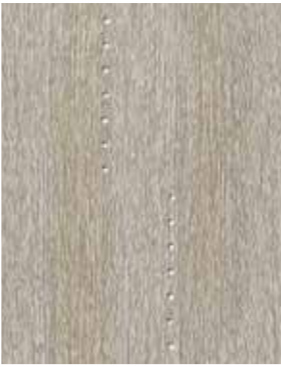
RUFFLE SILK JASPE Taupe