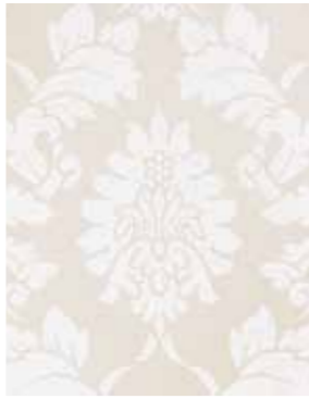
KOHINOOR DAMASK Oyster