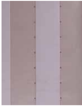
JEWELLED STRIPE French Grey