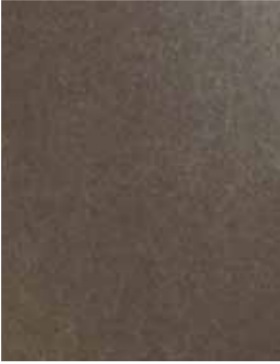
SILK VELVET TEXTURE Sage