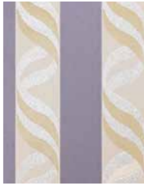
VENETIAN STRIPE Taupe Mauve