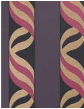
VENETIAN STRIPE Charcoal Black