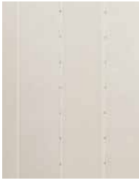
JEWELLED STRIPE Oyster