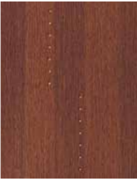
RUFFLE SILK JASPE Bronze