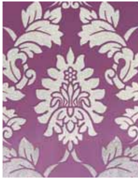
KOHINOOR DAMASK Mauve