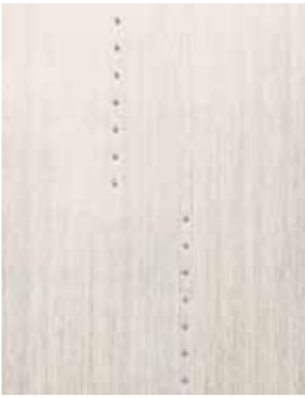
RUFFLE SILK JASPE Neutral