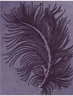
PLUME Mauve Black