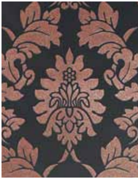
KOHINOOR DAMASK Black Copper