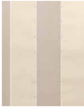
JEWELLED STRIPE Champagne