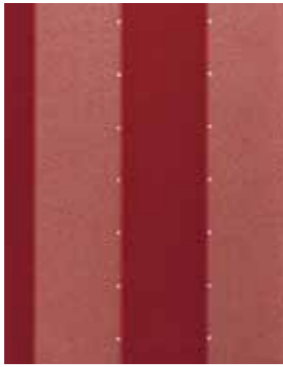
JEWELLED STRIPE Red