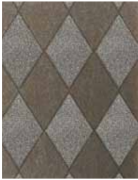
DIAMOND TRELLIS Sage