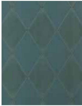
DIAMOND TRELLIS Petrol