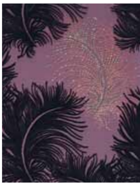
FEATHER PALACE Mauve Black