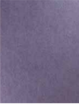
SILK VELVET TEXTURE Mauve