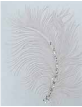
PLUME Pale Duck Egg