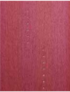
RUFFLE SILK JASPE Red