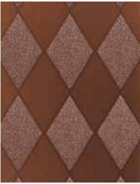
DIAMOND TRELLIS Copper