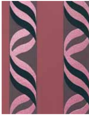
VENETIAN STRIPE Black Copper