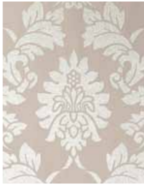
KOHINOOR DAMASK Taupe