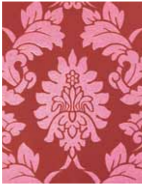
KOHINOOR DAMASK Magenta