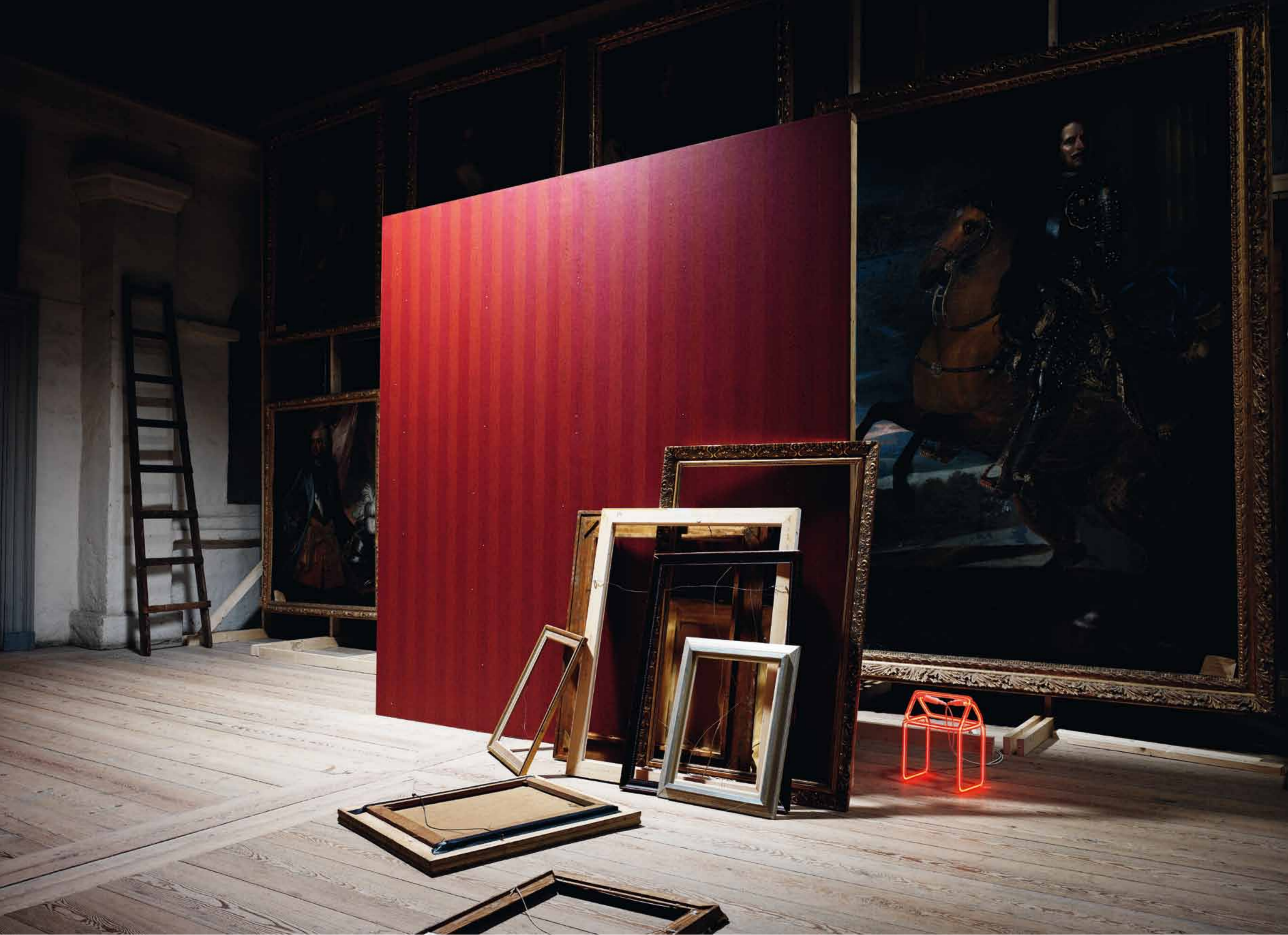
Ruffle Silk Jaspe