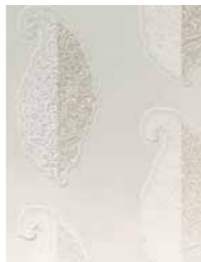
CASHMERE Duck Egg