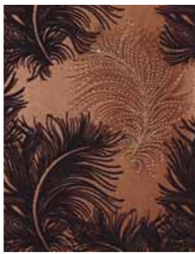
FEATHER PALACE Copper