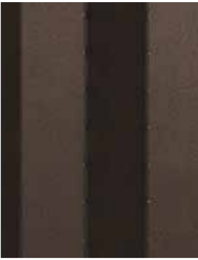
JEWELLED STRIPE Black Bronze