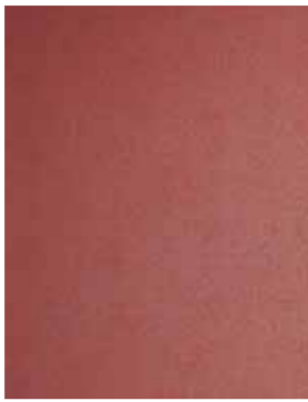
ORIENTAL CRACKLE TEXTURE Red