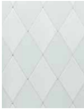
DIAMOND TRELLIS Duck Egg