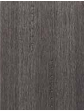
RUFFLE SILK JASPE Dark Grey