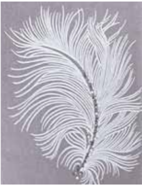
PLUME French Grey