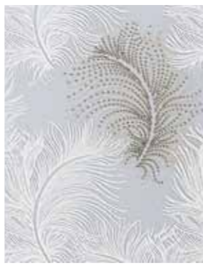
FEATHER PALACE French Grey