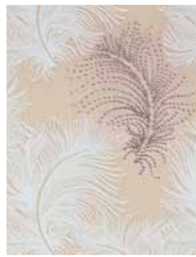
FEATHER PALACE Pale Aqua