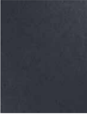
SILK VELVET TEXTURE Black