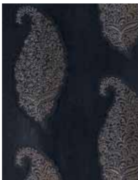
CASHMERE Grey Gold